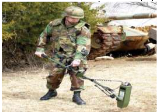
Fig 2.1 metal detector method

The following figure shows the use of metal detector for landmines detection. This method measures the disturbances of an emitted electromagnetic field caused by presence of metallic objects in the soil. But problem is plastic landmines cannot be detected by this method[11].