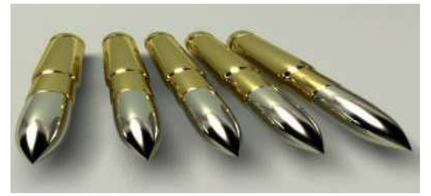
Fig.2.2. Radar bullets

Radar bullet is a special type of bullet the main use of radar bullet is to find landmines without setting foot into the ground. Microwave band have very large information carrying capacity thus internal structures of radar bullet consist of microwave Microwave emitter. emitter emits the electromagnetic waves whose wavelengths are conventionally measured in small number of centimeter called as microwave. The bullet emits a radar pulse as it grinds to halt .This pulse strikes the mine and its image gets available on the computer in the helicopter. following figure shows radar bullets that consists of microwave emitter.