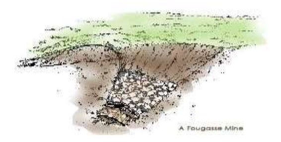
Fig. 1.1 A Cross Section of a Fougasse

landmines was know as fougass mine (see Fig:1.1) A fougasses were improved mines constructed by making a hollow in the ground or rock and filling with explosives like black powder. Firsty the gunpowder used in landmine was able to absorb moisture and water from air which consequently losses it's explosive ability.